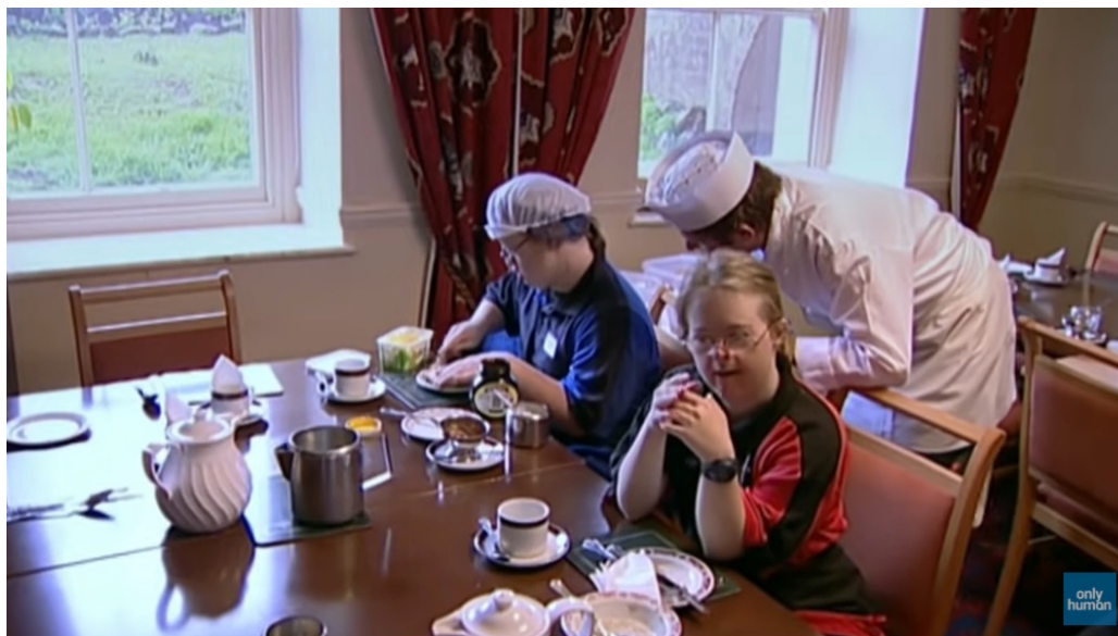
Welcome to the Strangest Hotel (Downs Syndrome Documentary) | Only Human

Watch the video of the Foxes Hotel experience: